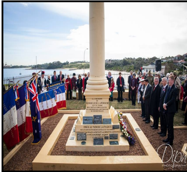
Bastille Day celebration at the Laperouse Monument